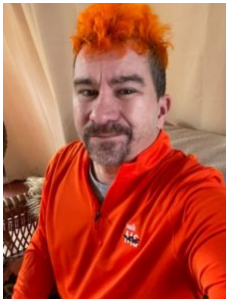
Brian L. / via Facebook.com