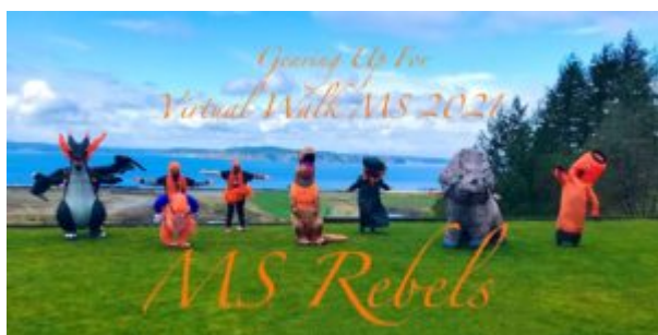
MS Rebels - Walk MS: South Sound / via Facebook.com